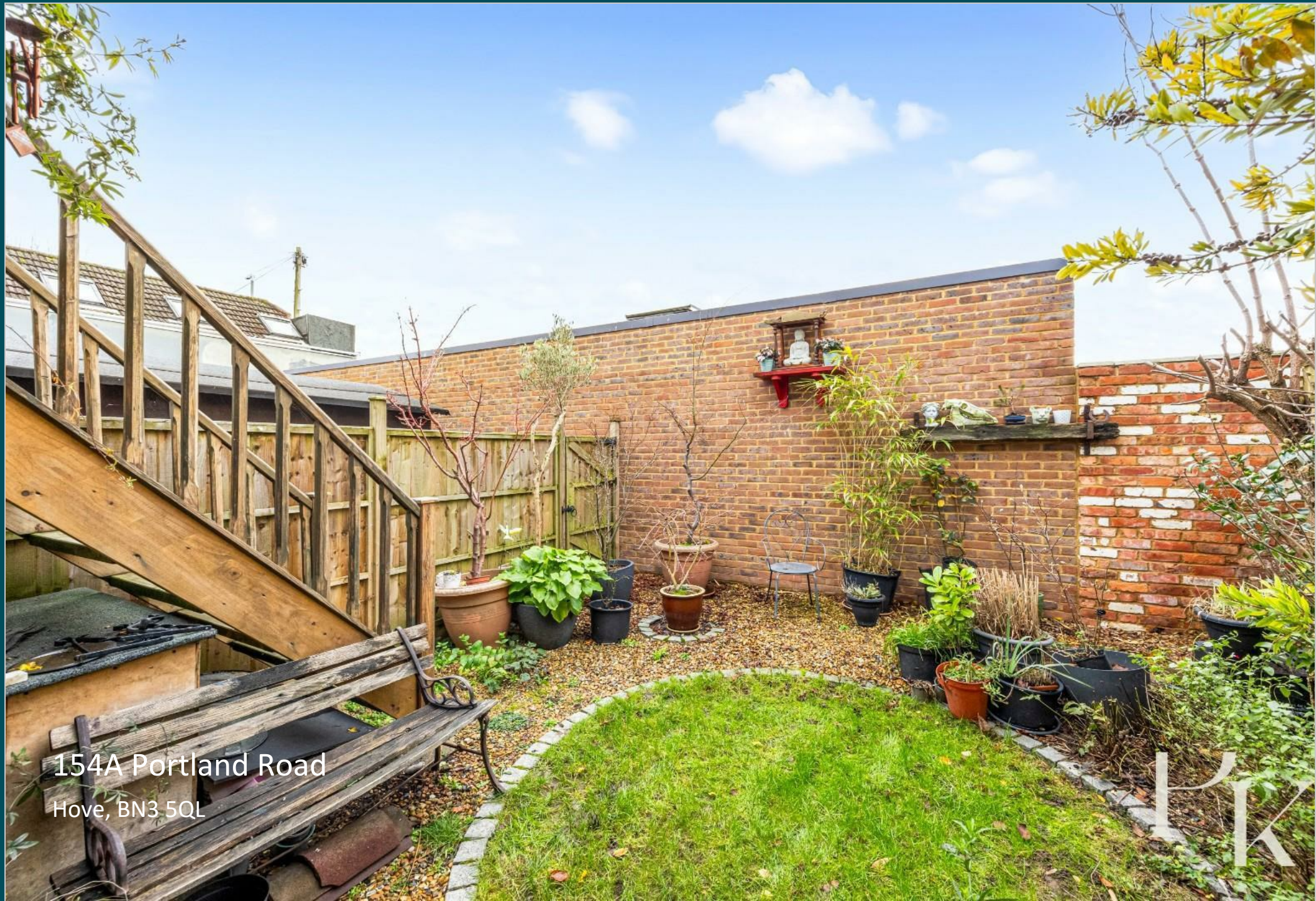
154A Portland Road Hove, BN3 5QL